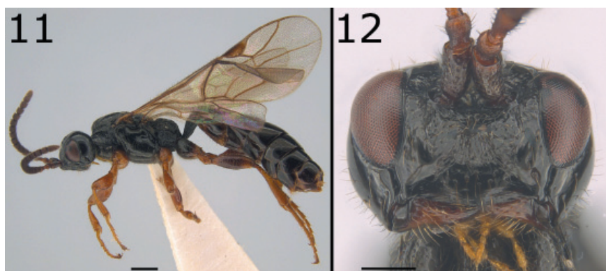
Figs 11–12. Microleptes splendidulus : 11 — habitus (lateral view); 12 — face (frontal view).