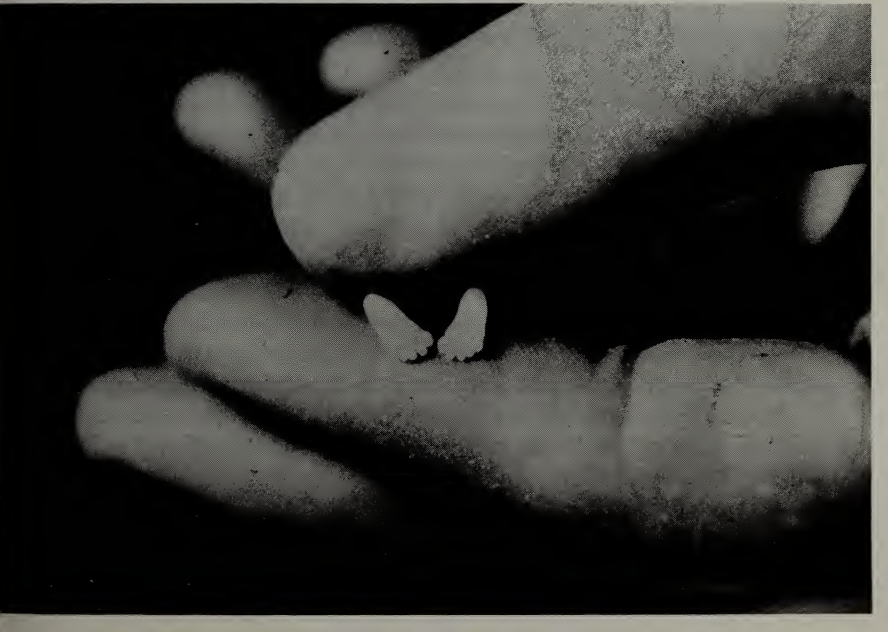
Feet that will never walk.