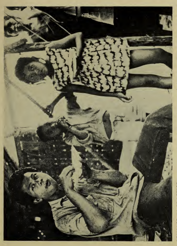
PEONAGE IN PRACTICE occurs too often. A farm family in Indonesia—all the family members work at a rice plantation—take a break for lunch. Pope Paul calls again for elevation and development of the family as the basic unit of society.