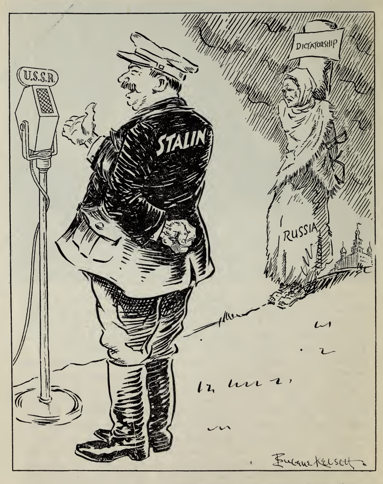
Hello! Hello! Workers of the world! The people of Russia are talking to you through me. They want you to know how happy they are under the Soviet regime.