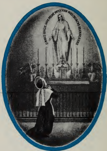
MANIFESTATION OF THE MIRACULOUS MEDAL TO SAINT CATHERINE ON NOVEMBER 27, 1830

such weight. A railroad signal, for instance, is nothing but a feeble light glaring through a bit of red glass. And yet that simple signal can halt the mightiest train and save hundreds of lives. So we may say that the Medal is a signal de-