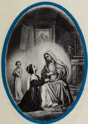
MARY'S APPEARANCE TO ST. CATHERINE JULY 18, 1830

Our Lady's fingers were aglow with precious