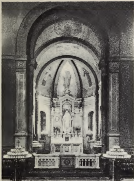
MARY'S CENTRAL SHRINE IMMACULATE CONCEPTION CHAPEL, ST. VINCENT'S SEMINARY 500 E. CHELTEN AVENUE, GERMANTOWN, PHILA. 44, PA.

The following indulgences were granted to Mary's Central Shrine: 1—A Plenary Indulgence may be gained once a year. Conditions—Confession, Communion, visit to our Shrine and prayers for the intention of His Holiness, the Pope. 2—A Plenary Indulgence may be gained under the same conditions by all who come to Mary's Central Shrine on a pilgrimage.