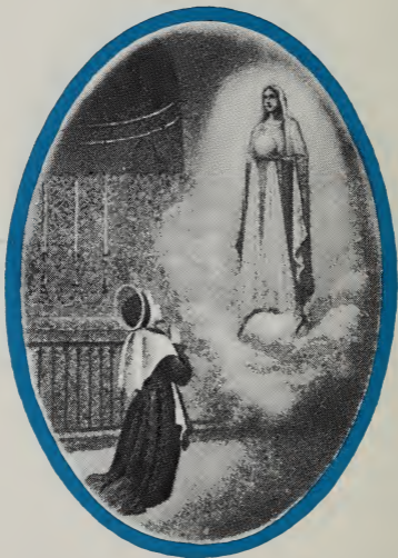
AS SISTER CATHERINE SAW OUR LADY EARLY IN THE APPARITION OF NOVEMBER 27, 1830

The globe in the Virgin's hands disappeared. Her hands, filled with the graces that the rays symbolized, were lowered and gracefully extended at her sides.