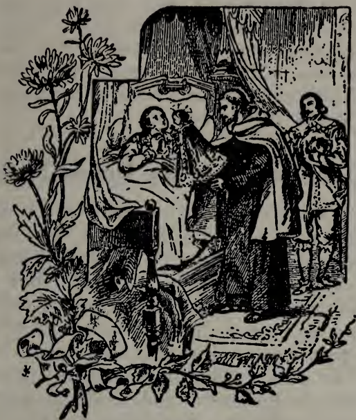
Cure of a dying woman

the Countess suddenly revived, her speech and hearing were restored, and in a few days her health had been completely regained. The happy and grateful lady was not unmindful of her promise to the Divine Infant. She presented Him with a golden crown, which, even to this present day, adorns the statue. Her husband, on his part, became a generous benefactor of the Carmelites throughout his life, and after his death left to the merciful De-