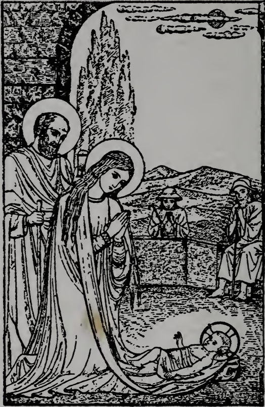
Copy of the beautiful picture through which a signal victory was won

ing before the Divine Child, while Saint Joseph, holding a lantern in his left hand,