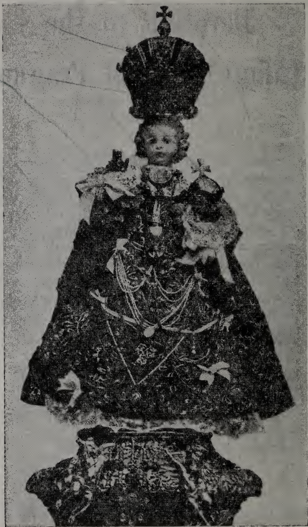
The Miraculous Image of the Infant Jesus of Prague