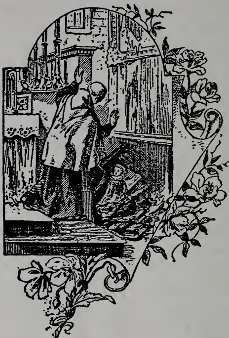
Father Cyrillus finds the Miraculous Image

been delivered from a most annoying dryness of soul through his fervent devotion to the Holy Infant.* Unfortunately, Prague