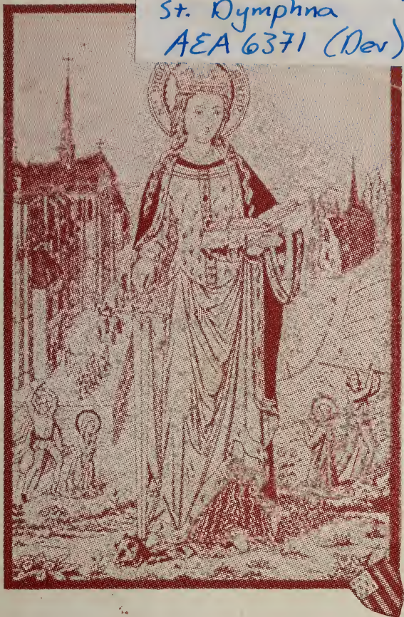
Devotion in Honor of St. Dymphna Virgin and Martyr

Devotion in honor of St. Dymphna AEA 6371 (Dev)