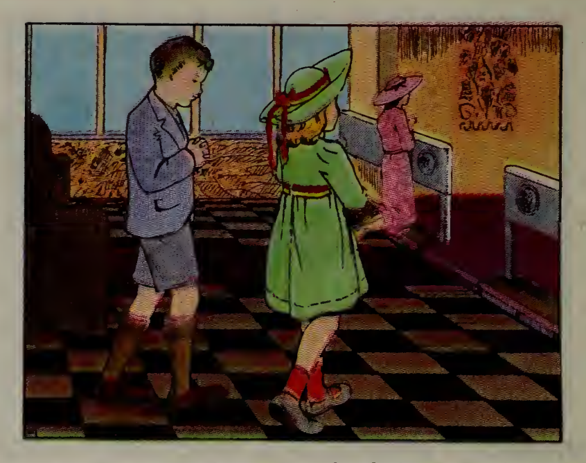
In going to and coming back from Holy Communion, hold your hands together and walk with great devotion.