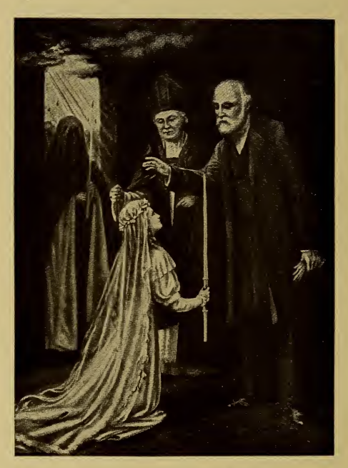
AT THE DOOR OF CARMEL