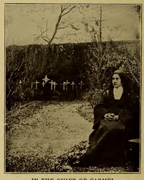
IN THE QUIET OF CARMEL