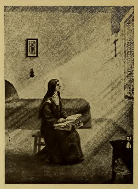
THE PEACE OF THE CLOISTER