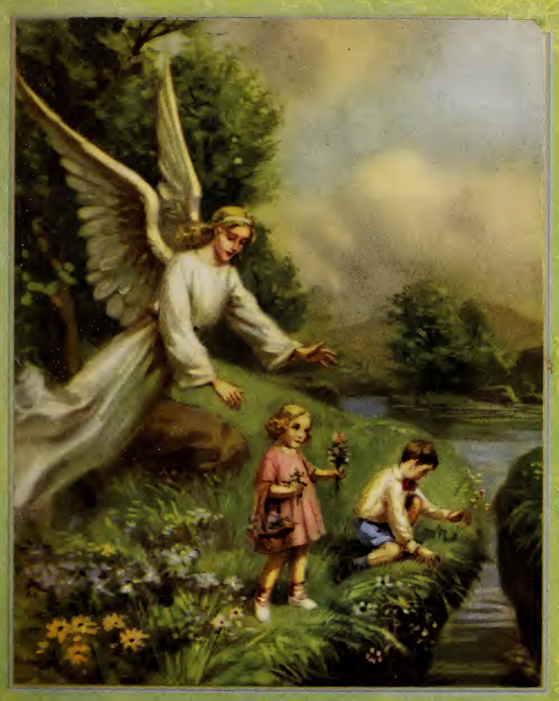
To Light, To Guard, To Guide