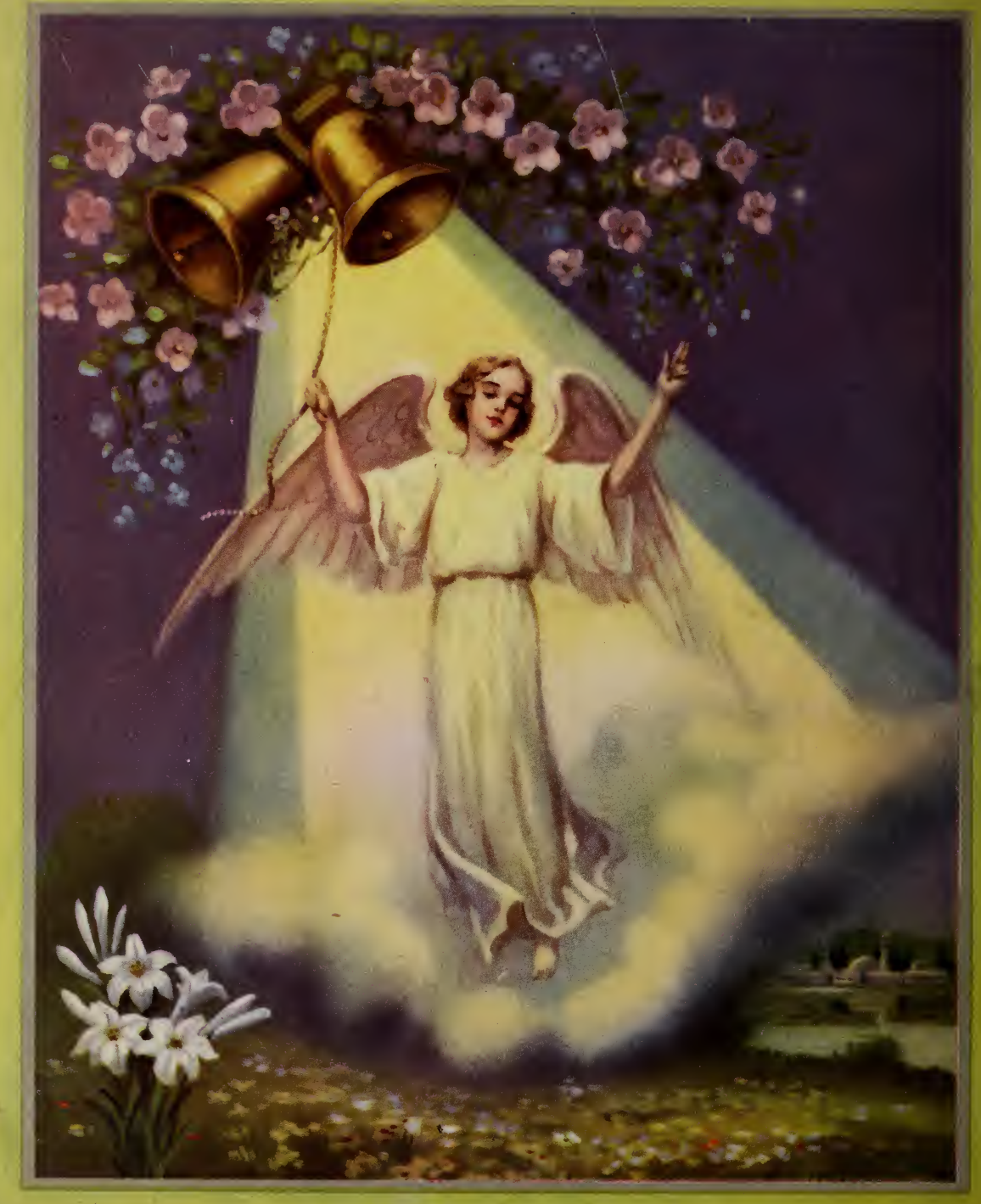
My Angel, Help Me to Love God