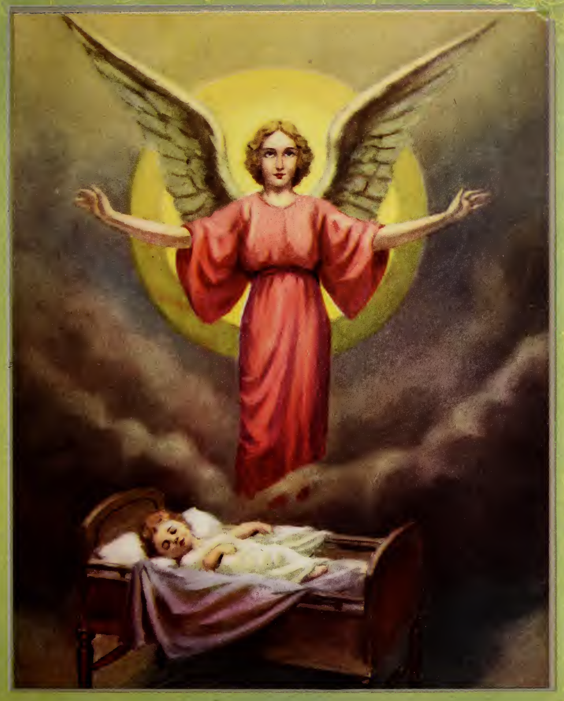
"Ever at My Side"