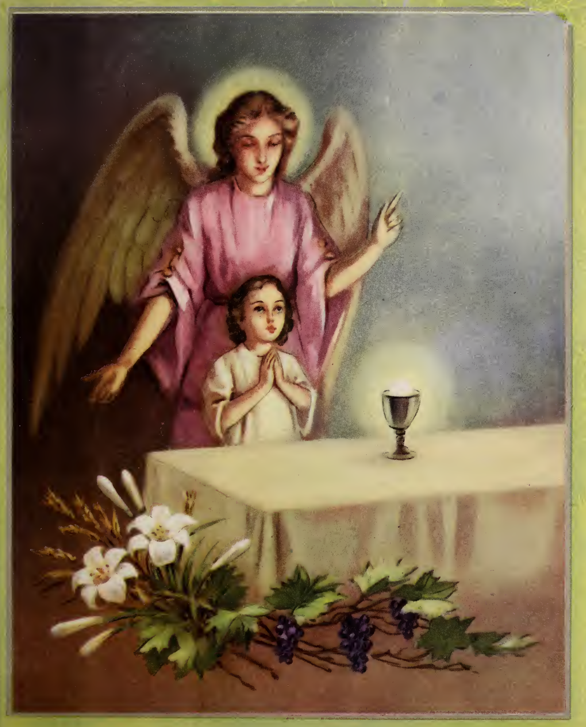
The Angels Lead Us to Our Lord