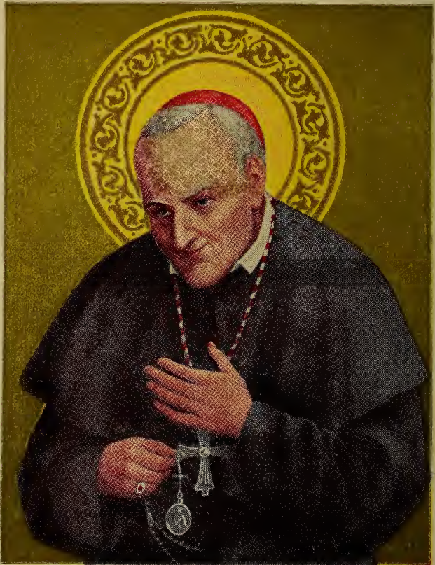
ST. ALPHONSUS MARIA DE LIGUORI