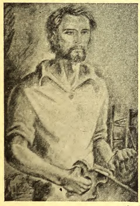
- Lynd Ward '