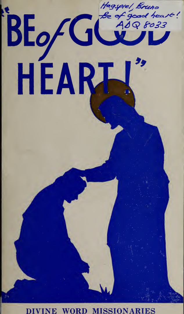
DIVINE WORD MISSIONARIES Techny, Illinois