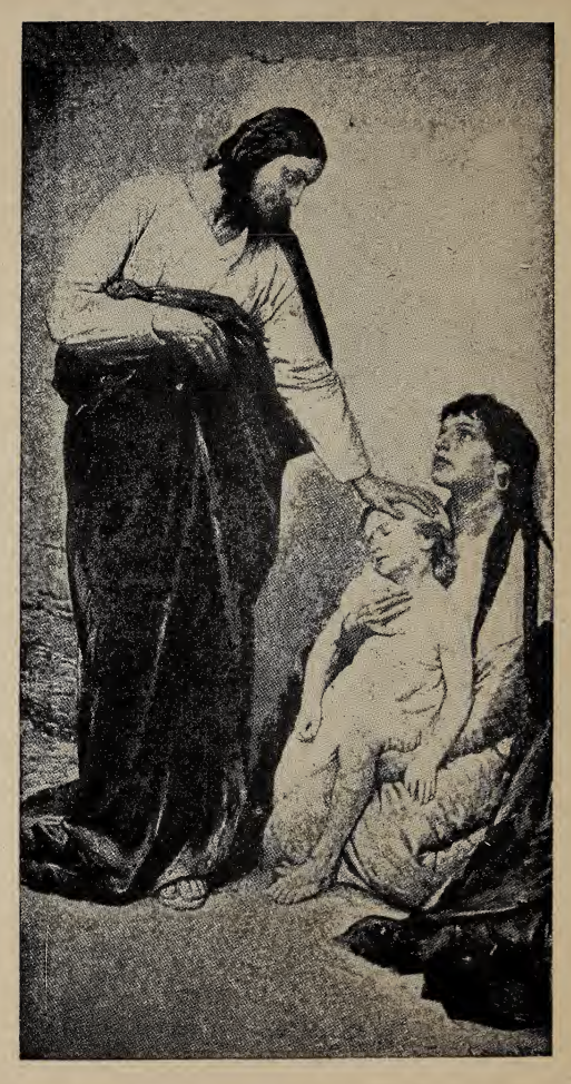
"Jesus of Nazareth...went about doing good and healing all..." (Acts 10:38)